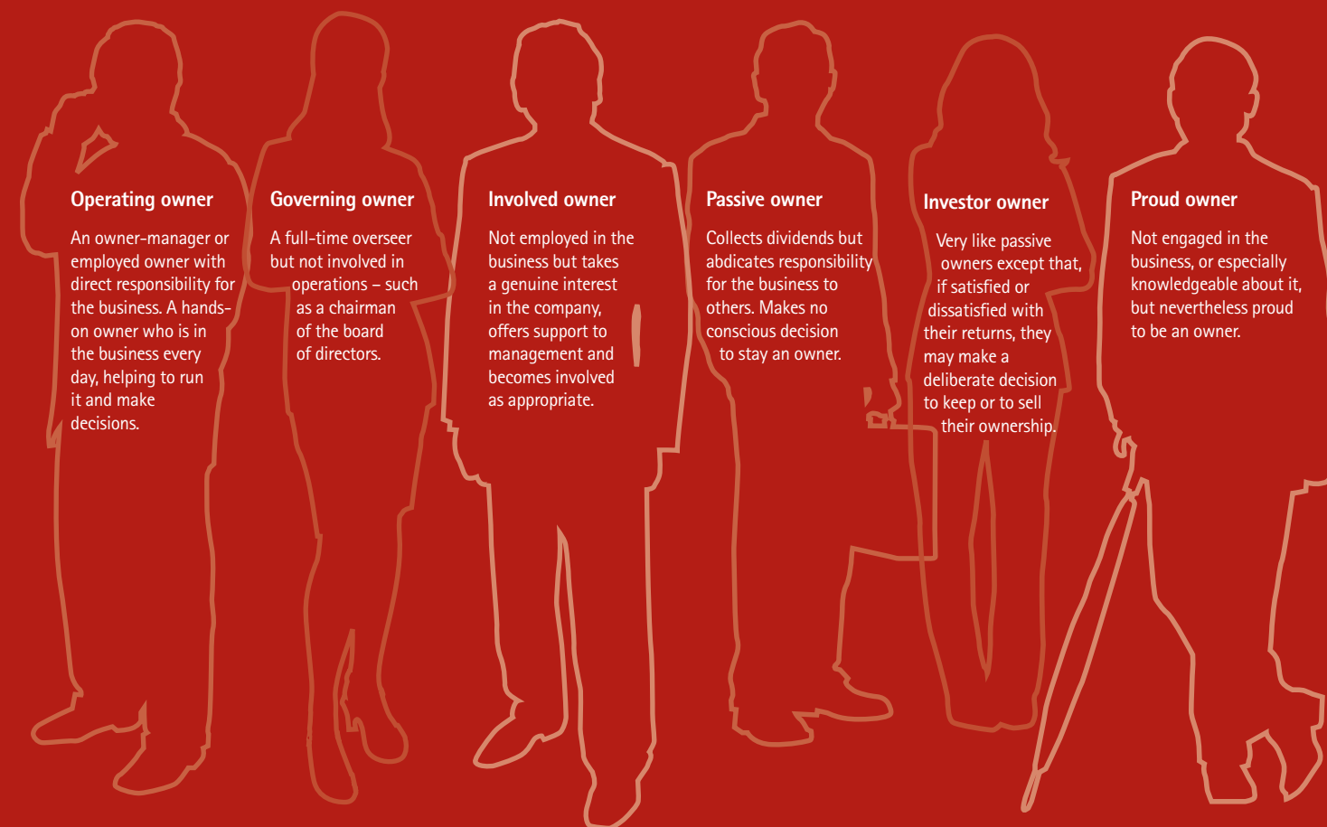
Exhibit 1: SIX TYPES OF OWNER