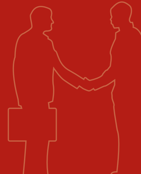
Exhibit 5: THE PROS AND CONS OF TRUST OWNERSHIP