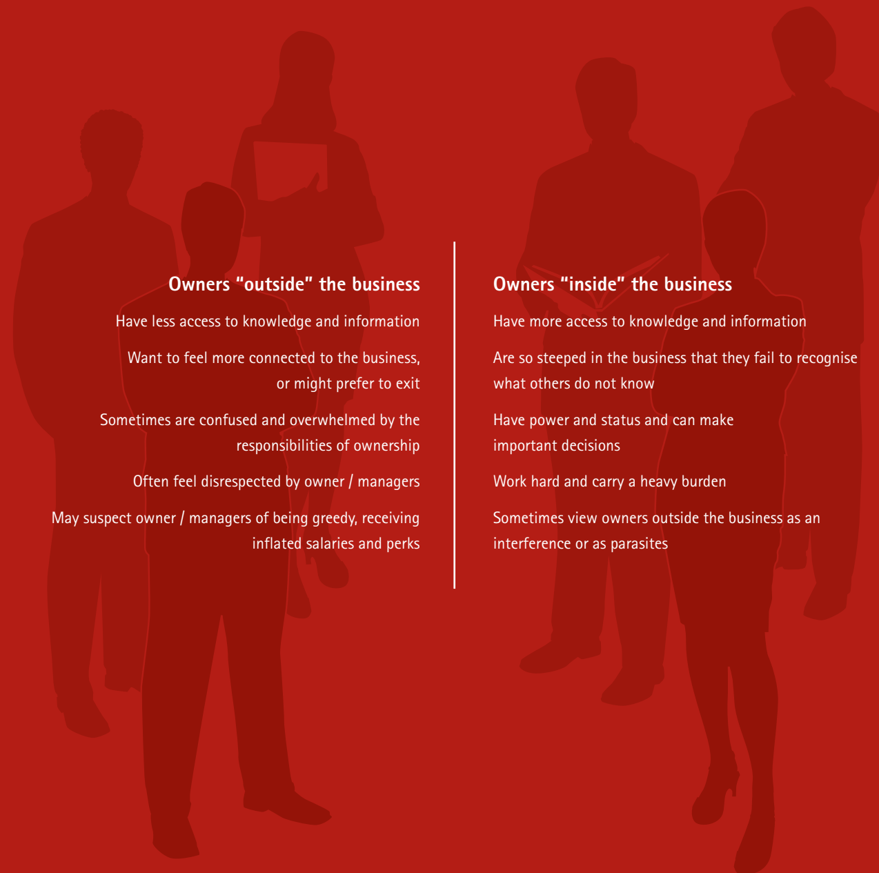
Exhibit 3: INSIDERS AND OUTSIDERS – HOW PERSPECTIVES CAN DIFFER